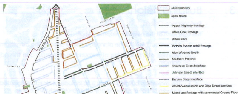
Figure 3 Street frontage heights and setbacks diagram