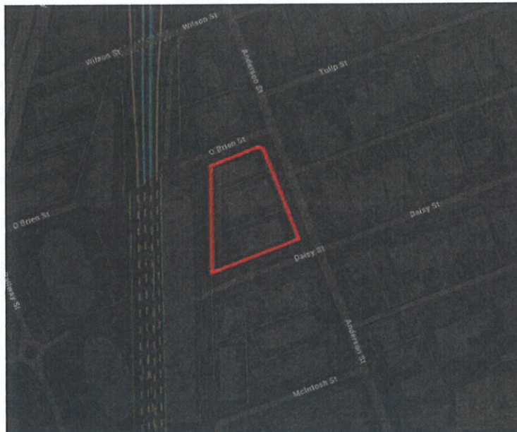
Figure 1 Site that is subject to this section of the DCP outlined in red

These controls apply to land currently legally described as SP80201, SP68797 and SP78790 at 44-52 Anderson Street, Chatswood.