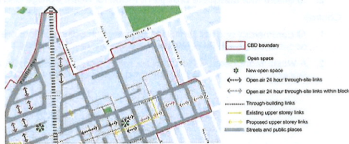
Figure 4 recommended links and new open space